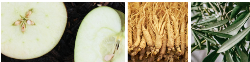
APPLE CIDER VINEGAR